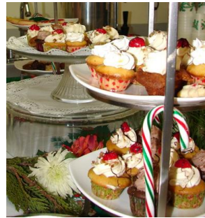
Some scenes from a previous Holiday Open House.